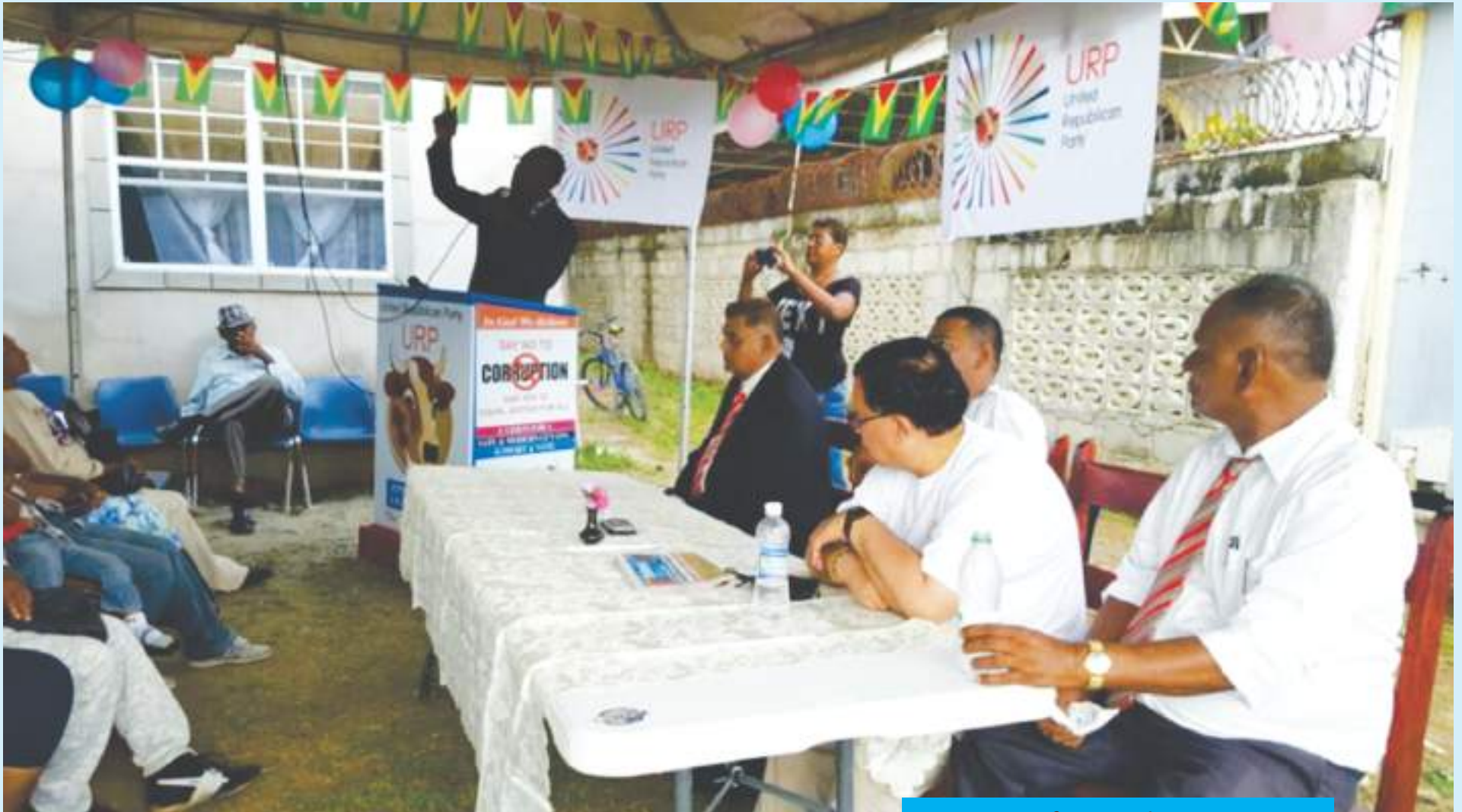
Scenes from opening ceremony

H undreds of Lindeners and other residents of communities in Region 10 converged in the mining town recently for the opening of 'Liberty House', the United Republican Party's Office at 271, Greenheart Street, Mackenzie which will serve Linden and other region 10 communities.